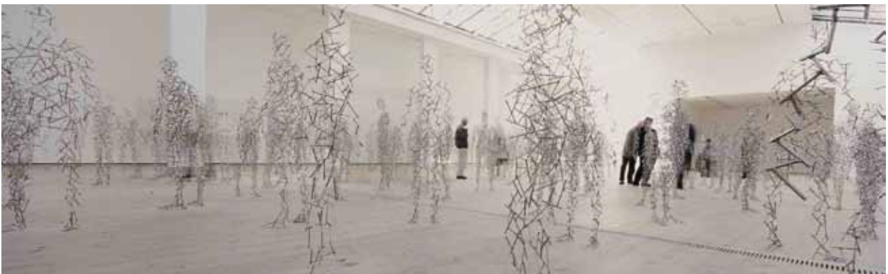
Domain Field (2003), Antony Gormley. Welded metal rod (Installation View 2)