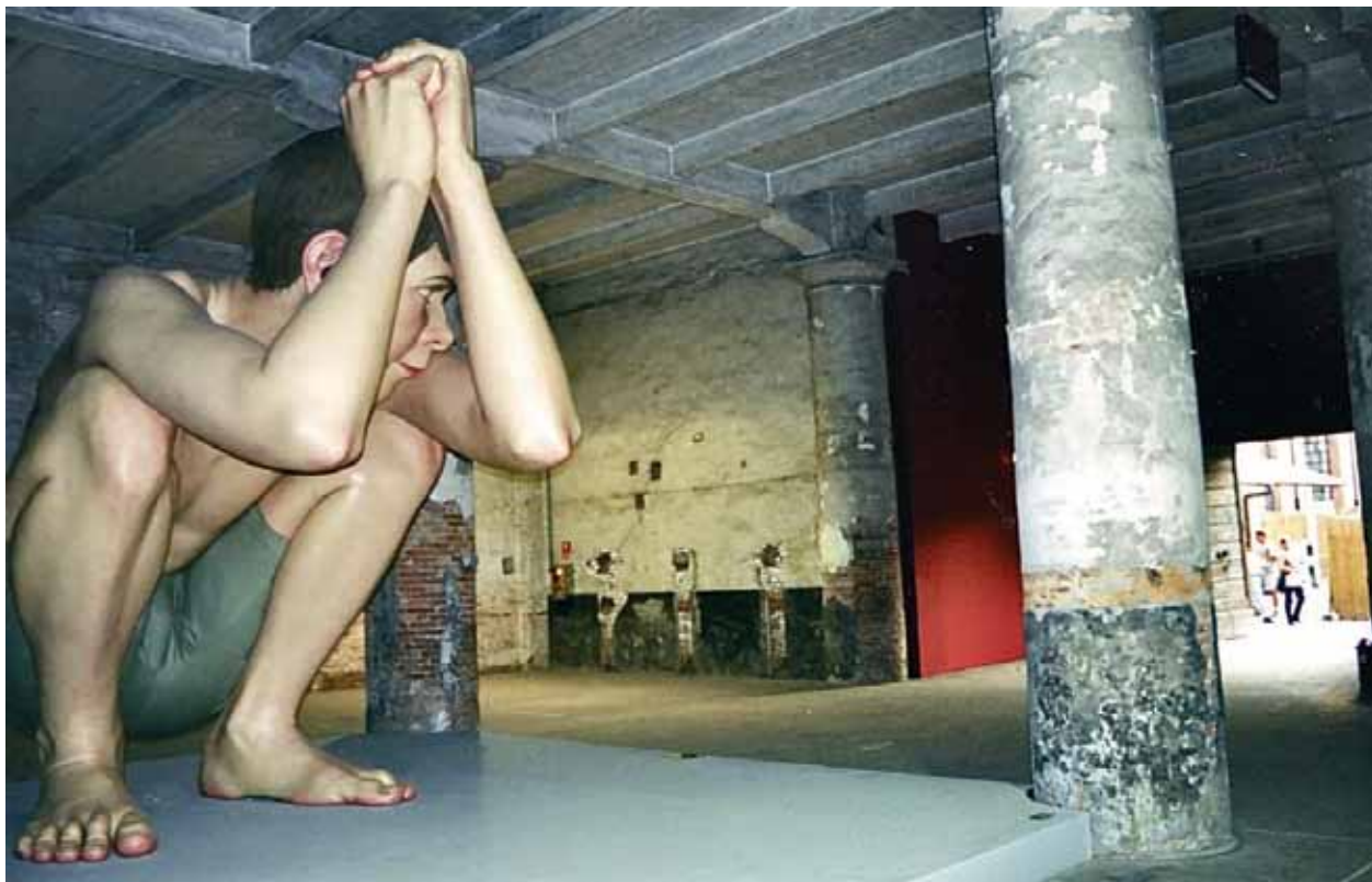
Boy (1999), Ron Mueck. Mixed media, 490 x 490 x 250 cm (Installation View 1)